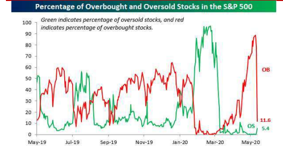
Chart of the Week A Slop of Reality

The chart above shows the percentage of stocks trading at overbought and oversold levels on a daily basis over the last year. On Monday, the net percentage of overbought stocks (overbought minus oversold) reached as high as 88.8%. As of Wednesday's close, the percentage declined but was still at an extraordinarily high level of 77.2%. After Thursday's rout, though, the net percentage of overbought stocks shrank to just 6.2%. That's a one day drop of over 70 percentage points!